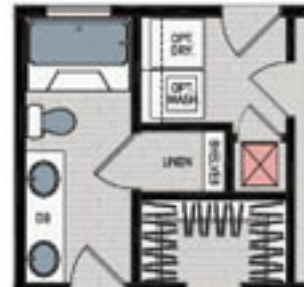
OPTIONAL PRIMARY BATH 2. W./ GARDEN TUB