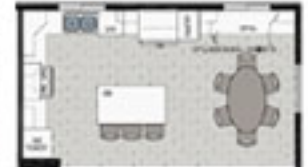
OPT. CABINETS IN D.R. AREA