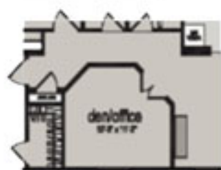
OPTION DEN / OFFICE IN LIFT OF BEDROOM 2.