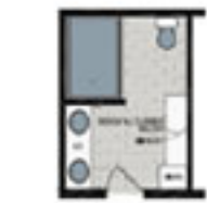
OPT. PRIMARY BATH 1 w/ 48"x72" SHOWER