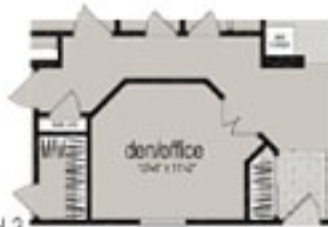
OPTION DEN / OFFICE IN (R) OF BEDROOM 2.