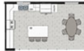
OPT. KITCHEN W/O. EURO RANGE