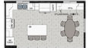
OPT. CABINETS IN D.R. AREA