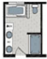
OPT. PRIMARY BATH 3 w/ 38"x60" SHOWER & PLATFORM TUB