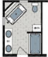
OPT. PRIMARY BATH 2 w/ 30"x60" SHOWER & SELF STANDING TUB