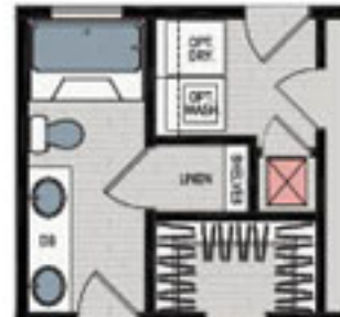
OPTIONAL PRIMARY BATH 2. W./ GARDEN TUB