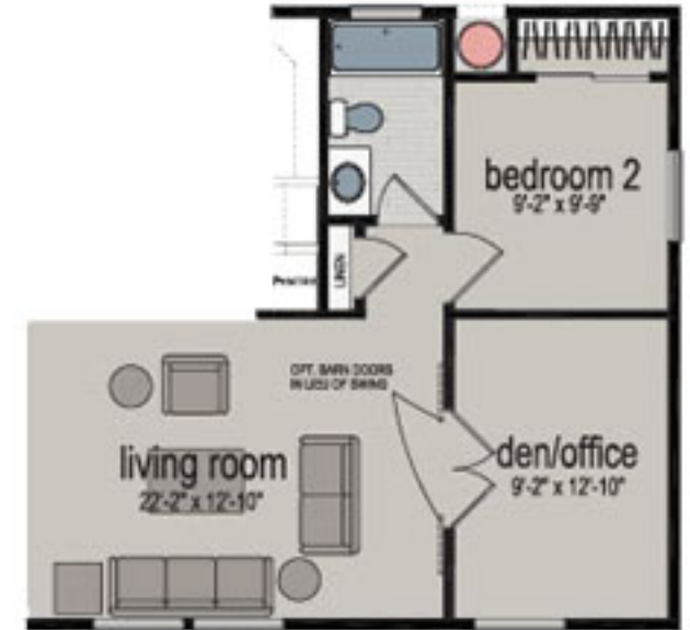
OPT. DEN IN LIEU OF BEDROOM 3