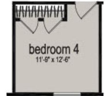
BDRM. 4 IN LIEU OF DEN