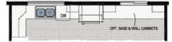
STD. KIT. w/ OPT. CABINETS IN D.R.