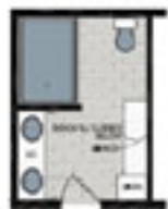
OPT. PRIMARY BATH 1, w/ 48"x77" SHOWER