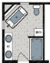
OPT. PRIMARY BATH 2, w/ 30"x60" SHOWER & SELF STANDING TUB