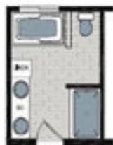
OPT. PRIMARY BATH 3, w/ 30"x60" SHOWER & PLATFORM TUB