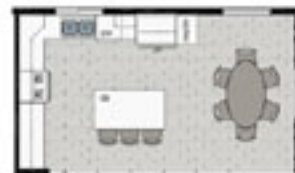
OPT. KITCHEN W/O. EURO RANGE