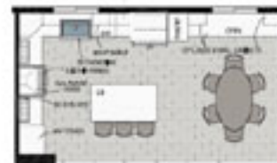
OPT. KITTOPIA KITCHEN