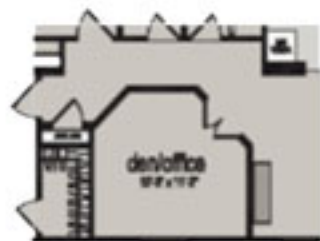
OPTION DEN / OFFICE IN LIFT OF BEDROOM 2.